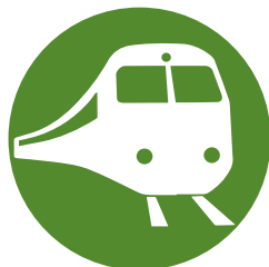
For railway stations and subways