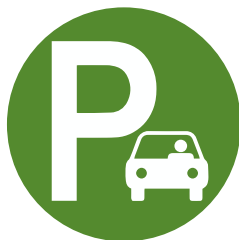
For parking lots